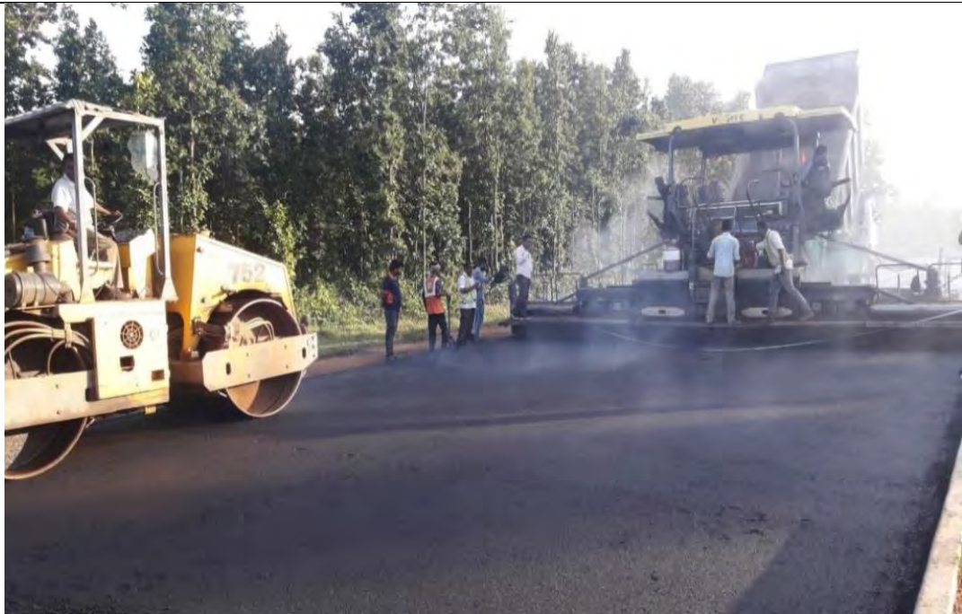
Authority Engineer Services: Bituminous Surfacing ; Baharagora to SingharaSection (4-lane); Odisha