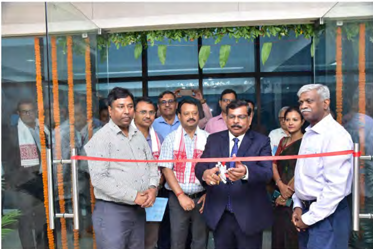
Senior officials of RITES Ltd at the inauguration ceremony in Guwahati

Gurugram, June 17, 2022: RITES Ltd., a leading transport infrastructure consultancy and engineering company, inaugurated its first office in Guwahati, Assam. Located opposite the Secretariat, in the heart of the city, the new office is spread across 5,500 square feet.