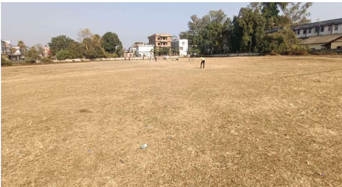
Earth Filling Work of Playground