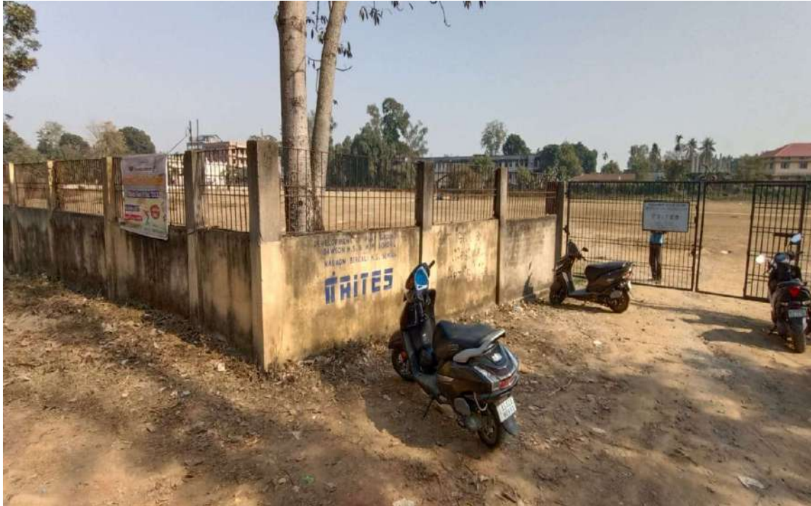
Iron Gate of Play Ground