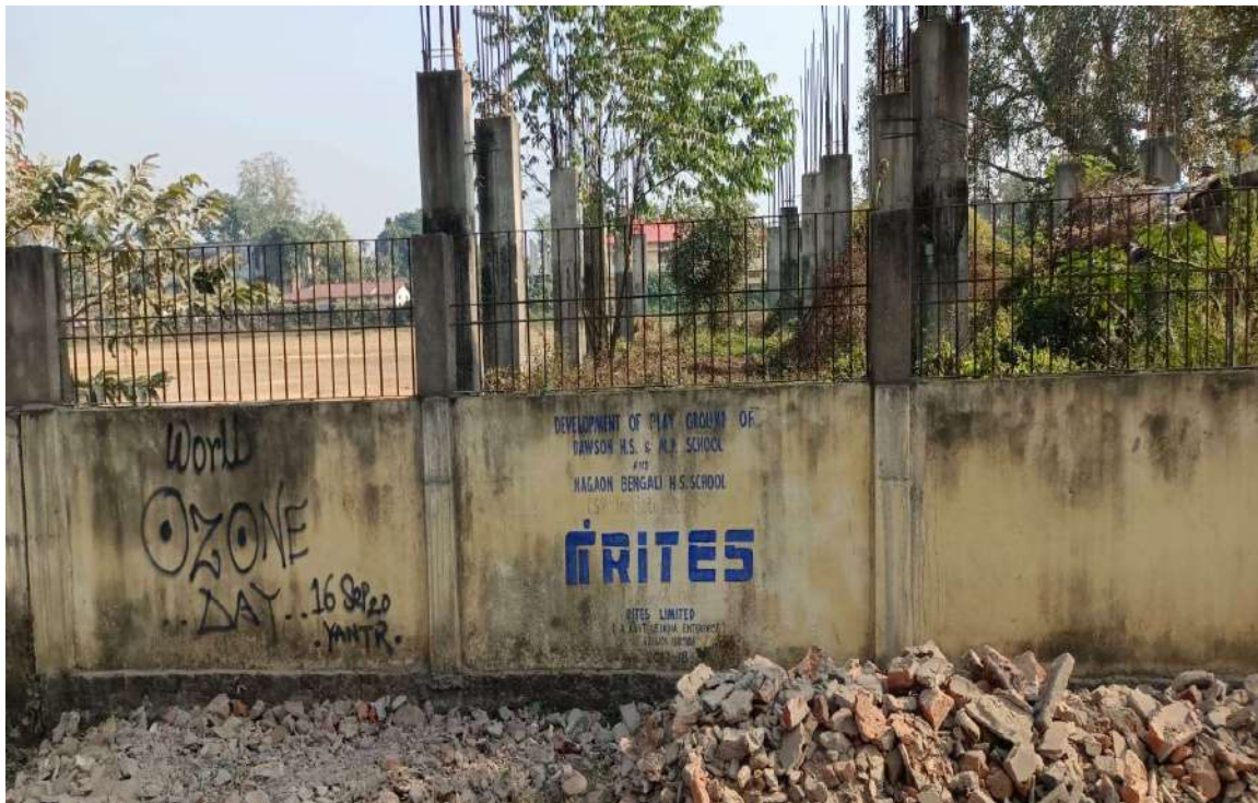
Incomplete Pavilion of playground