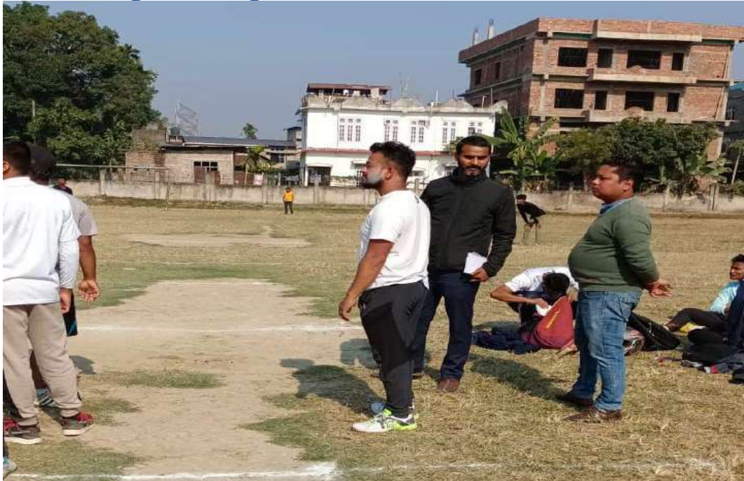
Discussion with Local resident member playing cricket at the ground