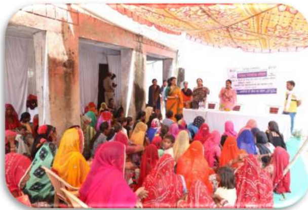
Skill Development Training center in Tehsil Kishangarh, Ajmer, Rajasthan.