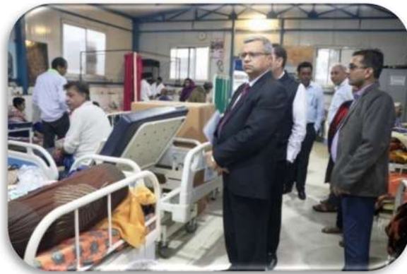
CMD RITES during visit at old age home and rescue center 'Gurukul' at Bandhwari village Gurgaon, Haryana