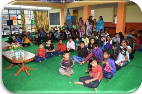
Children of SOS Village