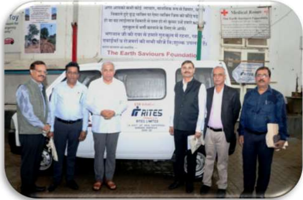
Handing over of van by RITES to The Earth Saviours Foundation