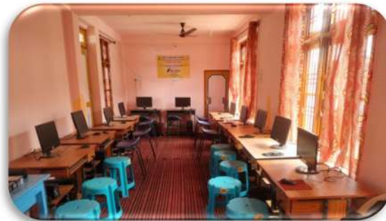
Computer laboratory in Bhartiya Vidya Mandir school