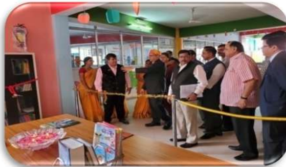
CMD along with Director Projects, RITES at Inauguration of Library

Financial Support for setting up infrastructure for Library in Government Schools, Southern Rajasthan.