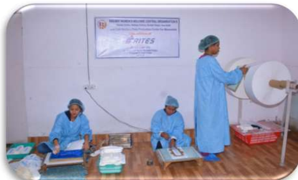
Low-cost Sanitary pad production centre at Railway colony Sarojni Nagar, New Delhi

11. Financial Support for Production of Sanitary Pads for distribution to needy women and Railway Passengers.