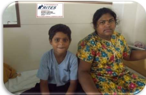
Beneficiary Children who underwent Surgery for Congenital Heart Diseases