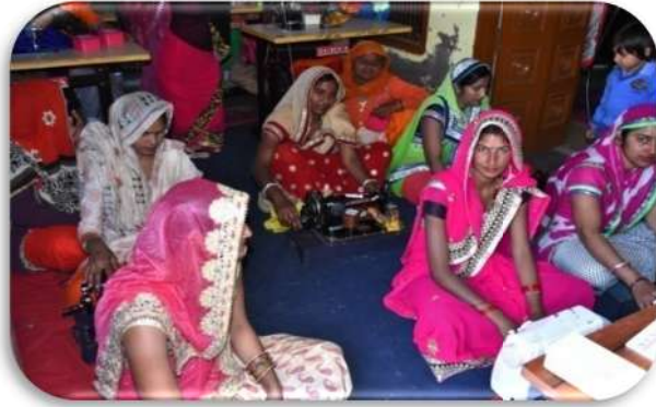
Skill development training Centre at Chhapera Village, Nuh Haryana