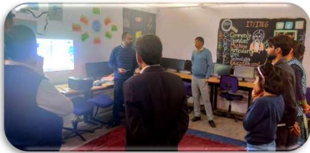
Digital classroom setup in Government schools of District Gurgaon, Nuh - Haryana and Jalaun, U.P

4. Installation, Operationalisation & Maintenance of 100 Smart Classrooms solutions in Government Schools in various districts.