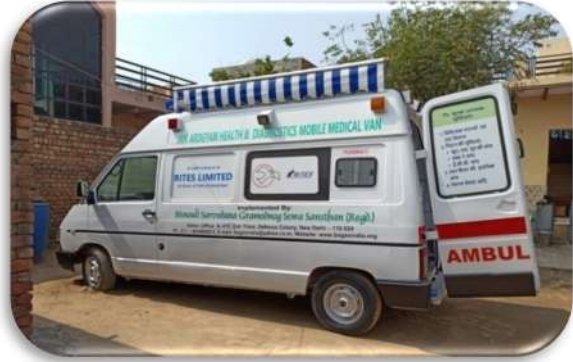
Mobile Medical Van unit under “Jan Arogyam” programme