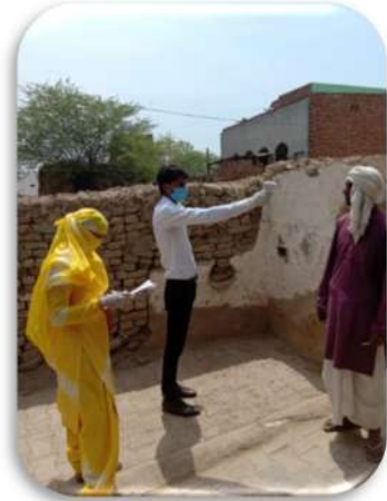
Medical staff of the community health clinic engaged in testing and awareness for COVID-19