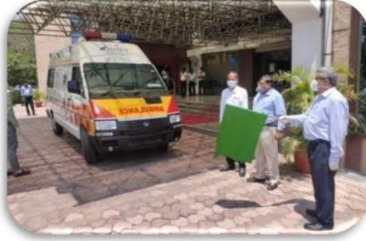
CMD along with Director Projects, RITES at the flagging off ceremony of Advance Life Support Ambulances (ALS)

16. Providing Advance Life Support Ambulances (ALS) to Government Hospital