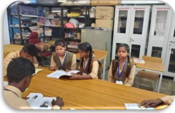
Library setup in the Government school

4. Installation, Operationalisation & Maintenance of 100 Smart Classrooms solutions in Government Schools in various districts.