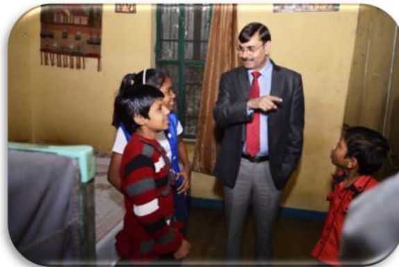
Children of SOS Village at Greenfields, Haryana

SOS children's villages of India: Sponsorship of Family homes and supporting youth for employment-linked education.