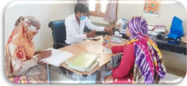
Community Health Clinic in Nuh, Haryana