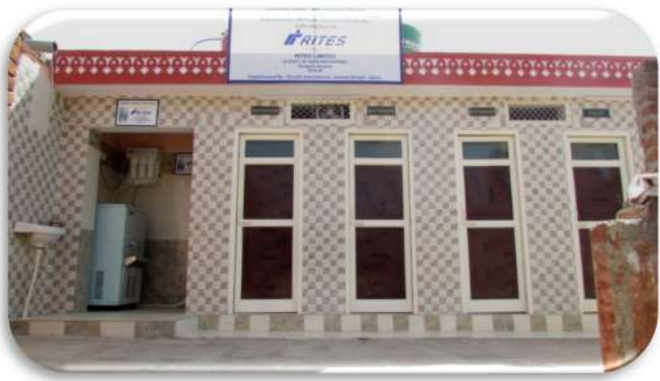
Community Toilet at cremation ground at Lal Kothi in Jaipur

19. Construction of toilet and setting up clean drinking water facility at municipal cremation ground in Jaipur, Rajasthan.