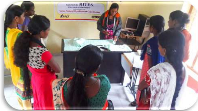
Skill Training for Livelihood projects like tailoring, farming etc.

11. Financial Support for Production of Sanitary Pads for distribution to needy women and Railway Passengers.