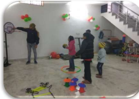
Special Education & sports Training to Differently-abled Children