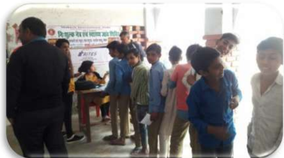
Eye & Health Check-up Camps in Nuh, Haryana