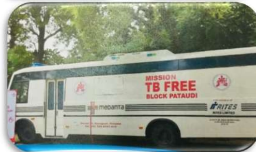
Launch of RITES Mobile Medical Unit for TB Free Haryana programme by Mrs. Sharmila Tagore at Pataudi, Gurgaon