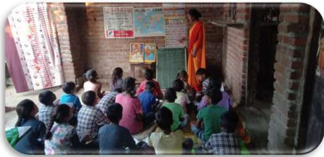
Concept of One Teacher School (Ekal Vidyalayas)