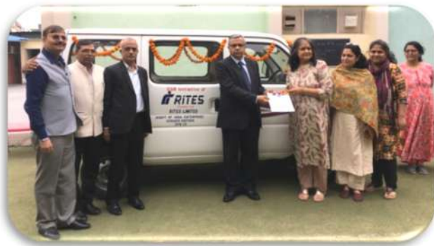
CMD RITES handing over a van to Gunjan Foundation

5. Providing RITES vehicles to NGOs for promoting Educational programmes and social welfare.