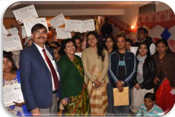
District Magistrate Ghaziabad with beneficiaries of Skill Development Training center in Khora colony Ghaziabad, U.P.

Empowerment of women through Skill Development Training Programmes.