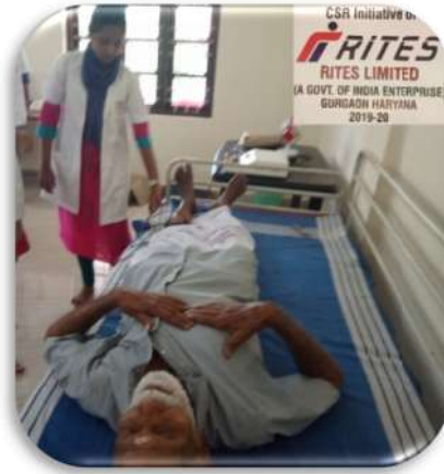
Physiotherapy & Fitness Centre at Anjaneya Old Age Home

13. Saving precious life of Children suffering from Congenital Heart Disease for children.